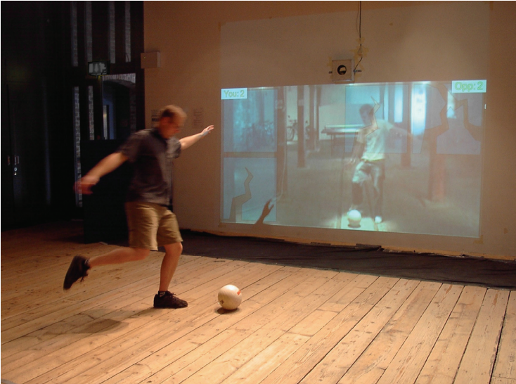
Fig. 1. Breakout for Two